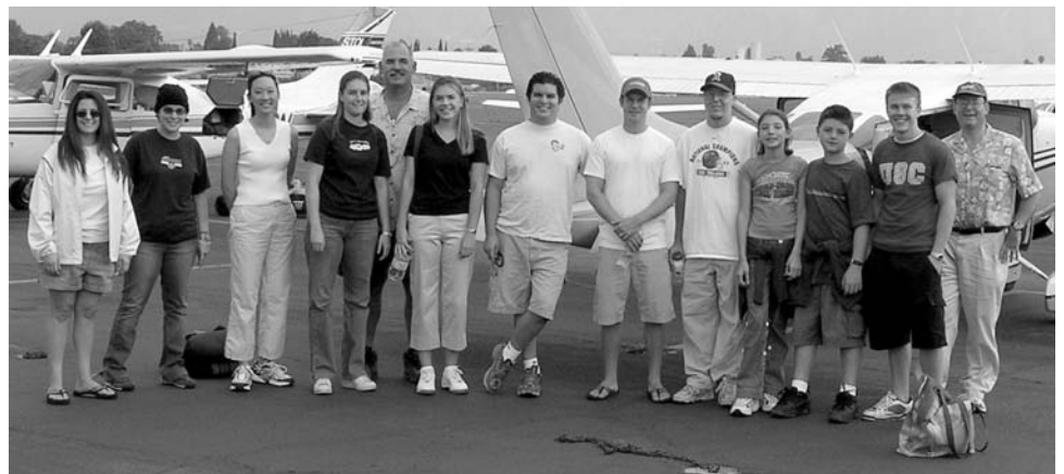
The volunteer team for the July mission prior to take-off from El Monte Airport.