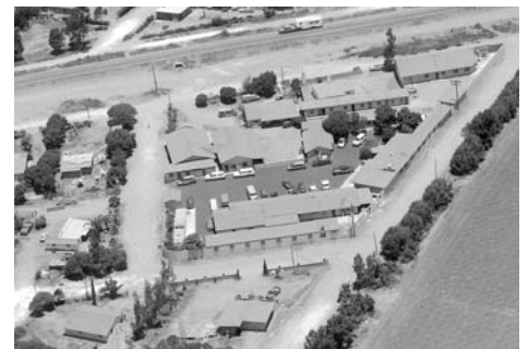
The Clinic at La Esperanza from the air.

Most times, our Mexican patients have never been to a chiropractor before and have rarely seen even a GP medical doctor or dentist. We serve their most basic needs with pain relief, and the MDs that we